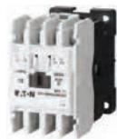
NEMA Size 3 CN15KN3A