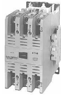
IEC Size N Cat. No. CE15NN3A